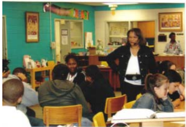
Sharon Draper with class.

author for approval. They do this all the time and will know if your plans fit their expectations. Be sure to schedule in ample breaks. You may want to plan an away from school lunch. We took Sharon Draper to a local restaurant for lunch with the principal, superintendent, media specialist, and teacher of the year. Find out what kind of equipment they need and be sure your author understands what you expect. Settle on the details of travel and lodging so that you know in advance what arrangements are your responsibility. Find out about book sales. Some authors bring their own books to sell. Sharon Draper allowed me to sell her books and I was able to make one to two dollars on each book to help defray the cost of the author visit.